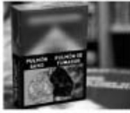
Caja de 20 cigarrillos