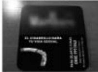
Caja de tabaco suelto