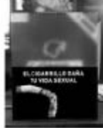
Caja de cigarros pequeños