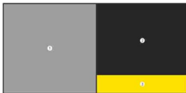
Figure 2 side-by-side format: 1: picture, 2: statement, 3: quitting message

E. If the height of the combined health warning is more than 65% but less than or equal to 70% of its width, it can be placed in the stacked format or the side-by-side format, as long as all the elements of the combined health warning are visible and undistorted.